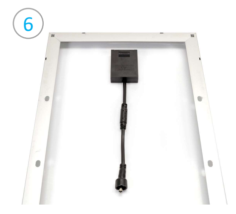
Replace the cover (Finished Example)