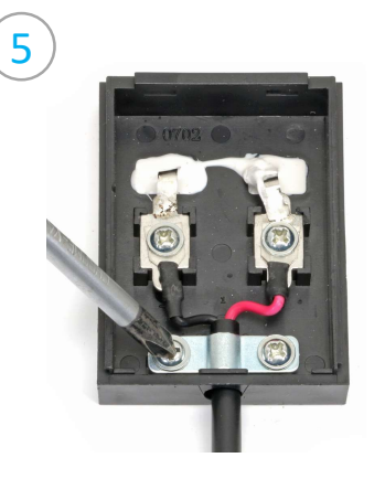
Replace the wire clamp with the hump facing downward