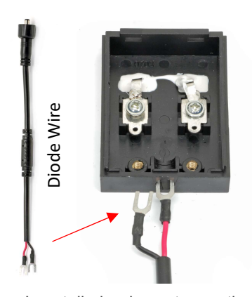
Insert diode wires, stagger the fork terminals for easy entry