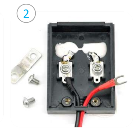
Remove old wires or cut them out if they are soldered