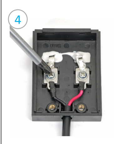
Attach the new fork terminals to the screw terminals & tighten