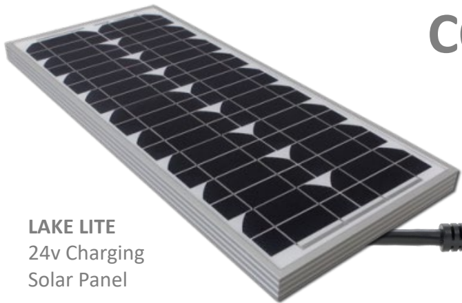
LAKE LITE 24v Charging Solar Panel